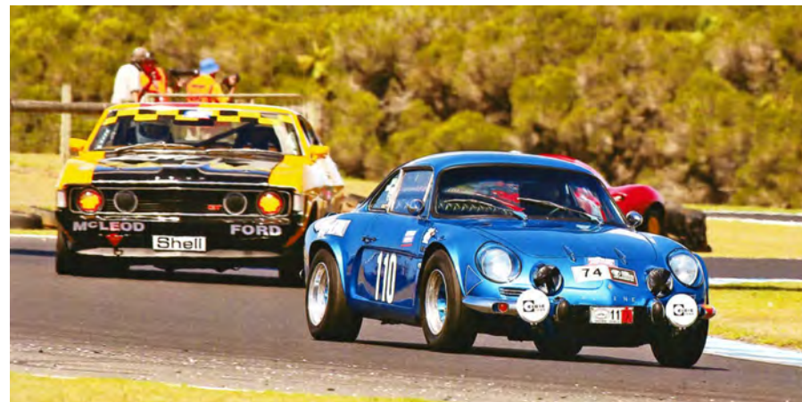
Mixing it with the big guns at Phillip Island

In 2017 and 2018 I joined other Alpinists for a run at Phillip Island. The track is a great drive and free flowing. The car performed well with no incidents, and we all had a great time mixing it with the big bangers in the regularity events.