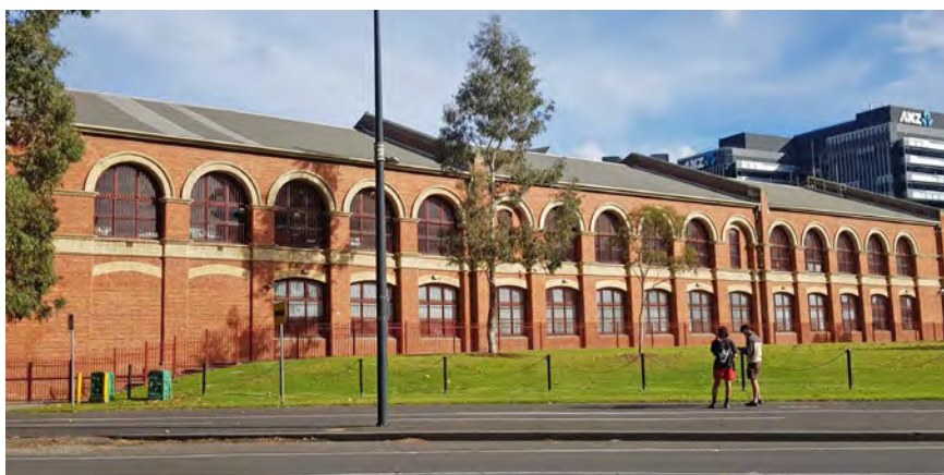
The Lindsay Fox Classic Car Museum at Docklands in Melbourne

In 2008, Sue and I visited friends in southern Chile, and did a short road trip to Bariloche, just across the border in southern Argentina. Bariloche was full of French cars, including many 504s – though I did not spot a 504 XS on that trip. In the 1990s, Bariloche was revealed as a refuge for Nazi war criminals and there were even rumours that Hitler himself had escaped there. Southern Chile was certainly a destination for many German immigrants, dating back to the 1840s, and German remains the third language of the area after Spanish and English. However, most historians agree that Hitler died in his bunker in Germany.