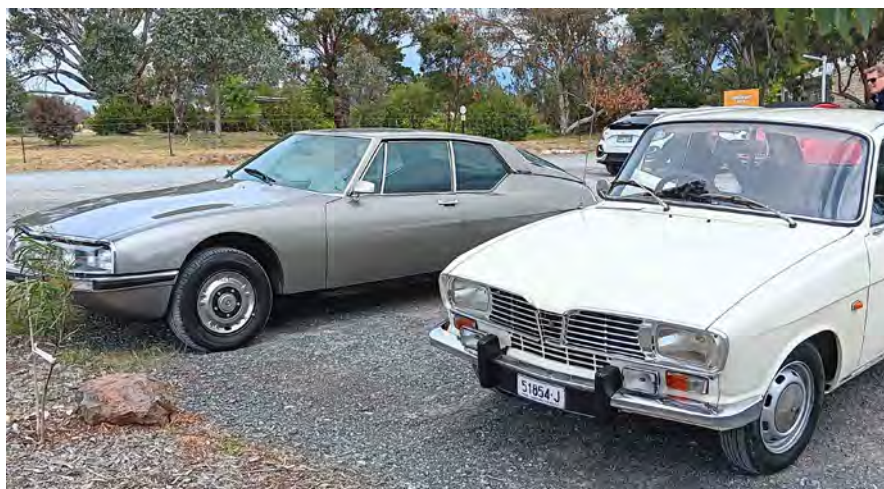
Nice cars! French Car Drive to Strathnairn on 26 th October 2025.

30 November French Sounds of Summer at the French Embassy Details to be confirmed.