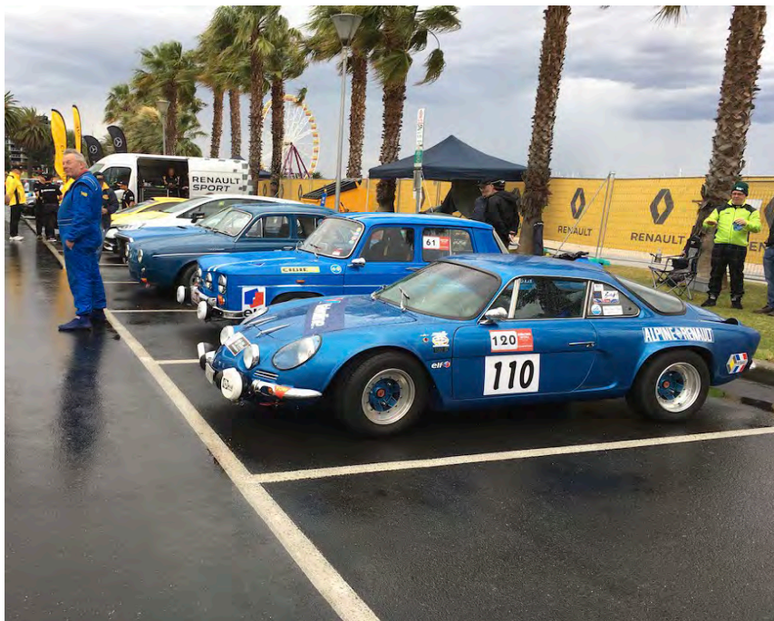
My car lined up with other Renaults, on the Esplanade at Geelong Reserve

This event basically consisted of a car show, hill climb and a sprint down the Esplanade. It was great fun and well organised. I have not attended a further event as they have scrapped the hill climb.