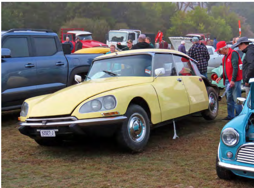
Citroenella with her skirt lifted, at Wheels of Wamboin, 2025