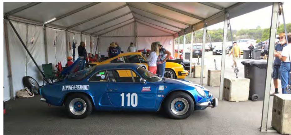
In the pits at Phillip Island