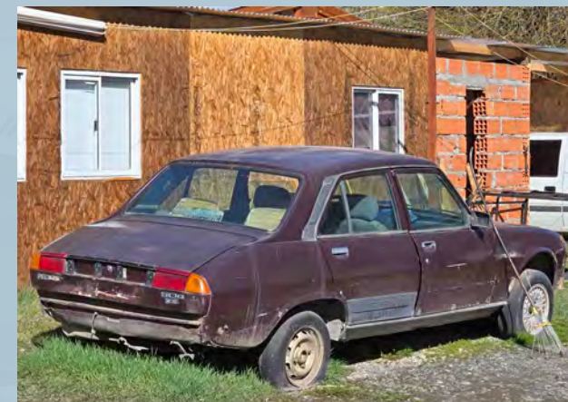
On the cover A rather tired South American-built Peugeot 504 XS, spotted in Patagonia, Argentina