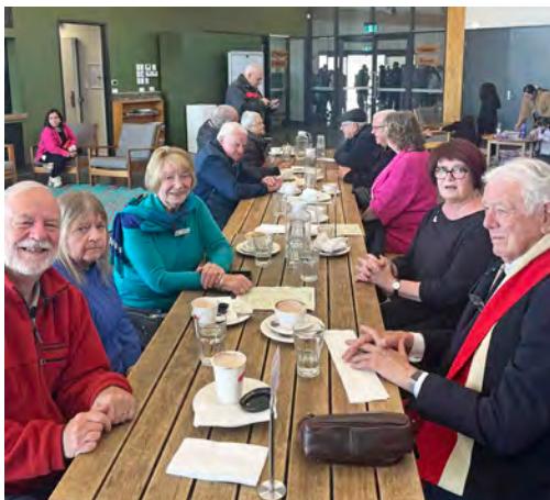
The long table at Wildbark.