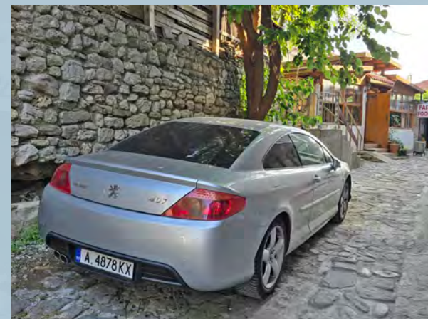
On the cover The unmistakable sleek lines of a Peugeot 407 coupe, gracing a cobblestone alley in the ancient city of Nessebar, Bulgaria.