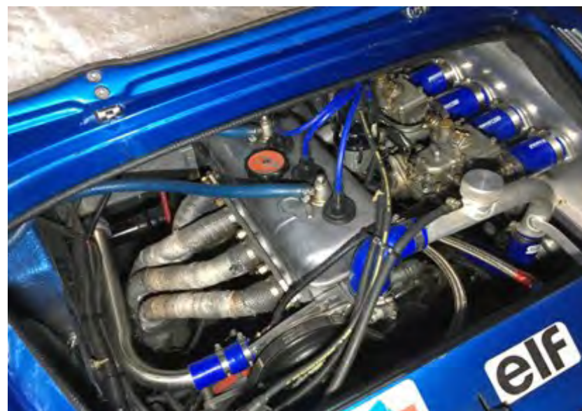
Engine bay showing R8G motor and cold air box