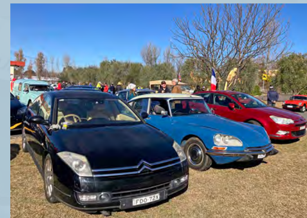
On the cover Citroens galore at the annual Battle of Waterloo event, with interstate cars swelling the French ranks in Canberra.