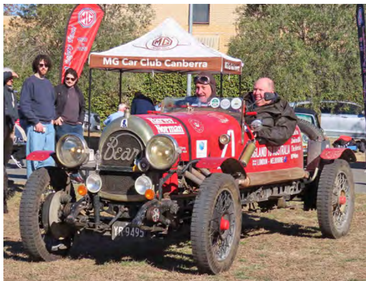
Arriving in style, with goggles up, at the Battle of Waterloo.