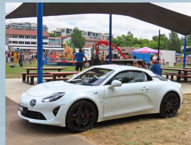
On the cover A very nice 2018 Alpine A110 Legend at French Car Day, owned by Paul Bridgman