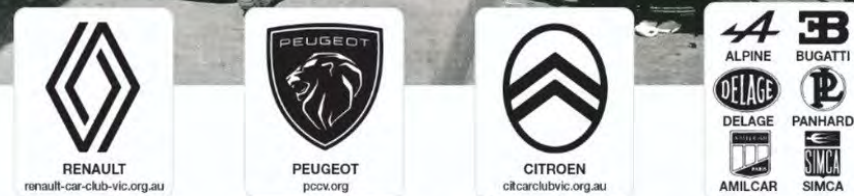
Featured horsepower from Renault, Peugeot, Citroen & More

At 'Living Legends', Woodlands Historic Park, the home of equine thoroughbreds ( livinglegends.org.au ) Woodlands Drive, Greenvale 3059