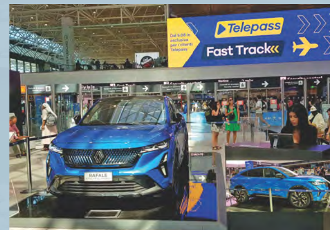
On the cover Renault Rafale, on display at Rome international airport