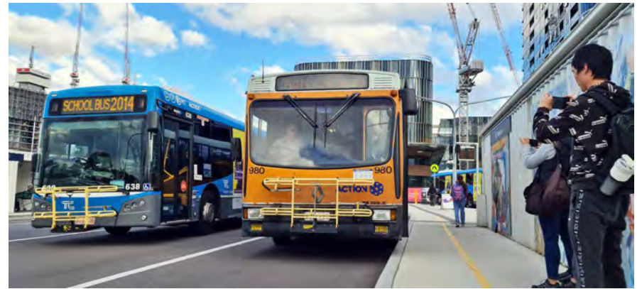
The last Renault leaves Woden Interchange, 31 August 2024.