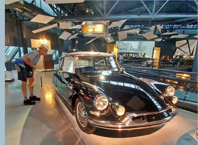
On the cover A beautiful 1961 Citroën DS19 in the Riga Motor Museum, Latvia