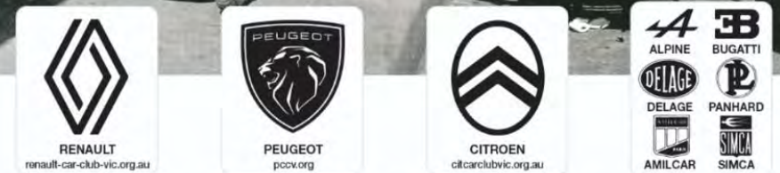
Featured horsepower from Renault, Peugeot, Citroen & More

At 'Living Legends', Woodlands Historic Park, the home of equine thoroughbreds ( livinglegends.org.au ) Woodlands Drive, Greenvale 3059