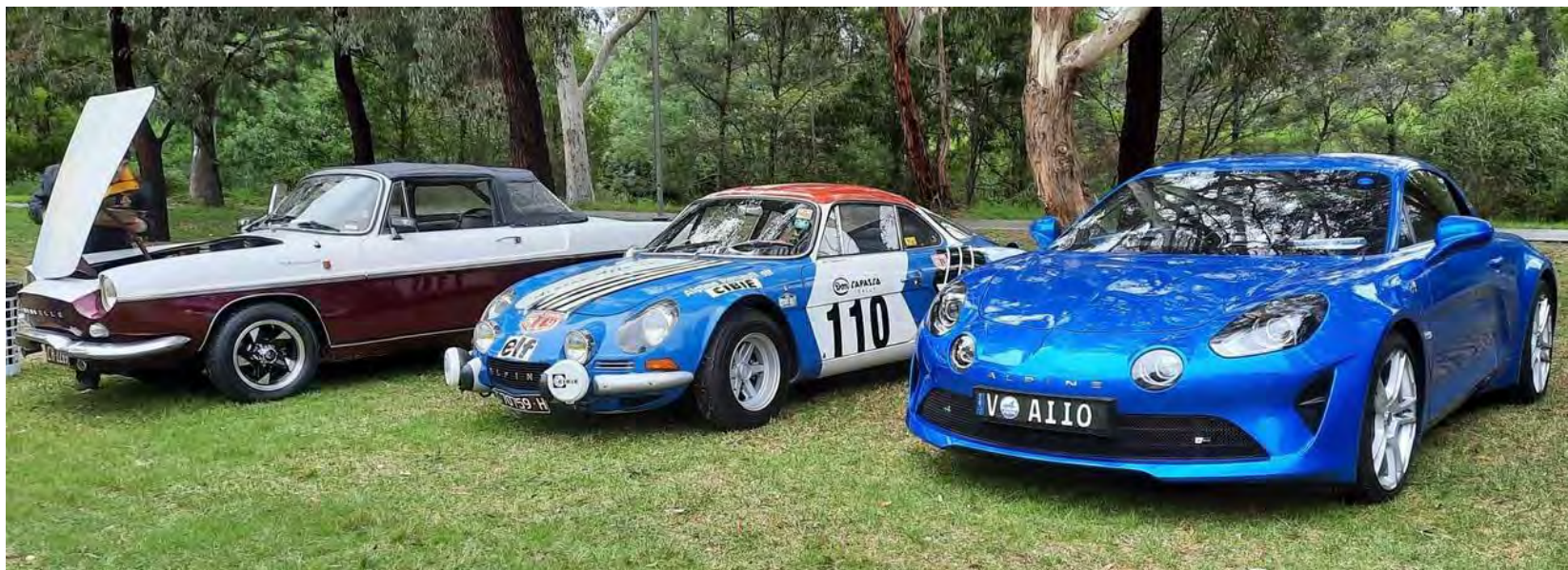
A fine Renault Caravelle (left) and two Alpines