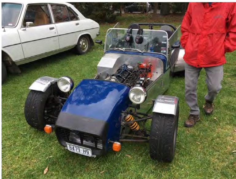
An unusual Peugeot-powered sports car