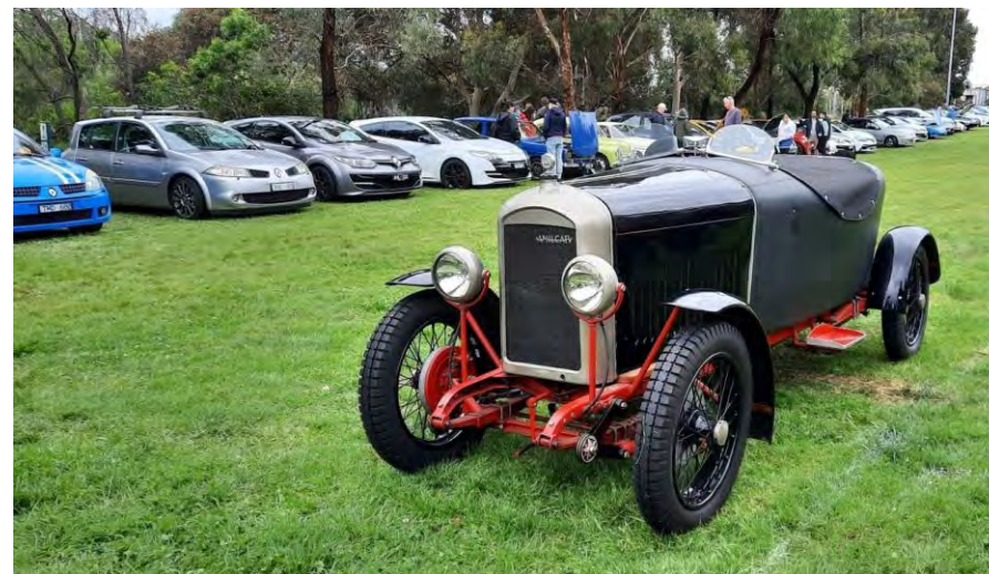
An Amilcar takes pride of place

Unfortunately, my return trip to Canberra met with some kangaroos just 10km from resulting in substantial damage to my new Alpine A110. It is now in Melbourne undergoing the necessary repairs.