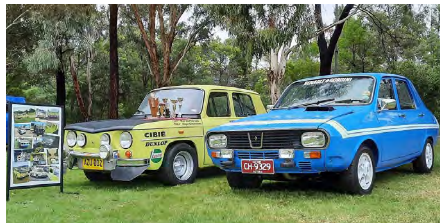
Two fine Renault Gordinis, an R8 and an R12