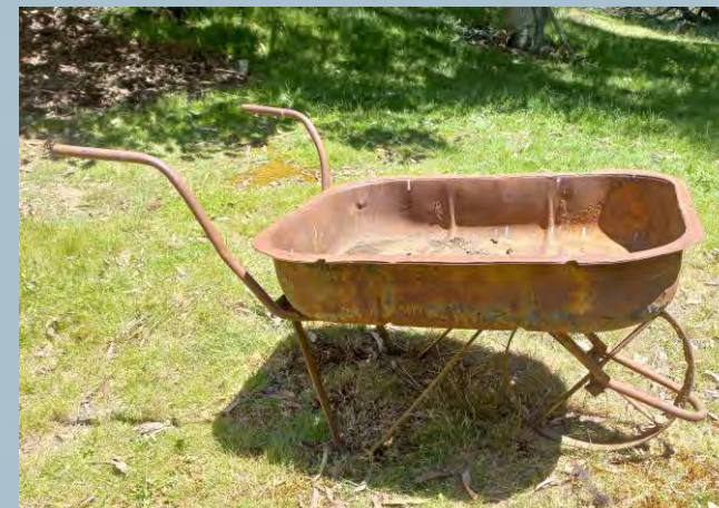
On the cover A Colin Handley creation: a re-purposed Peugeot 403 fuel tank wheelbarrow