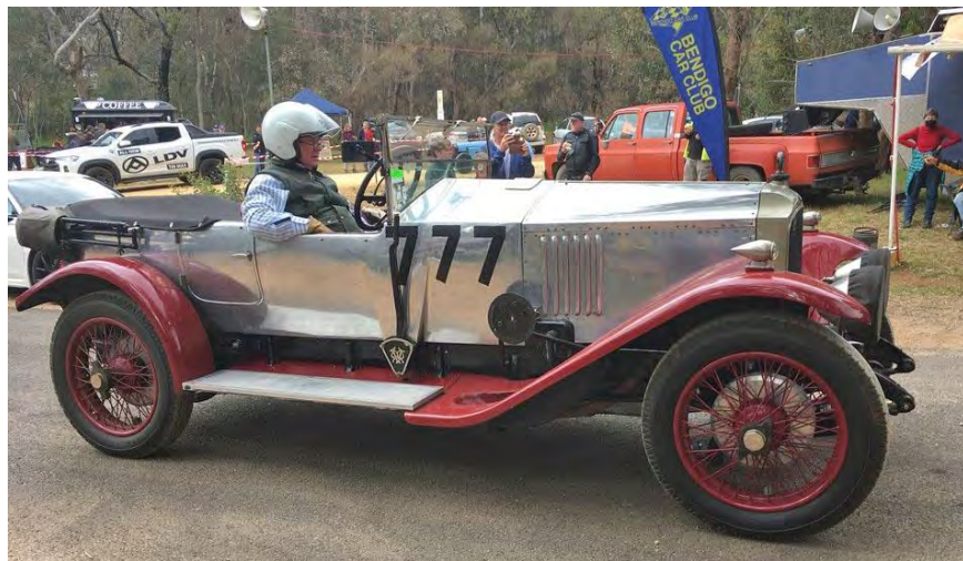
A Vauxhall just like my grandad used to have but never raced.