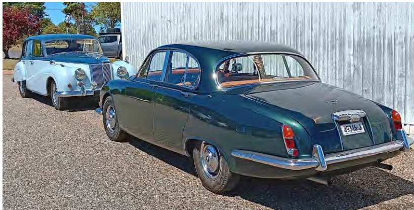
Two stately limos, an Armstrong Siddeley and a Jaguar— just visiting

The Cooma Car Club Museum is open every Tuesday from 10am to 1pm and the first Saturday each month from 10am to 2pm. It is well worth a visit.