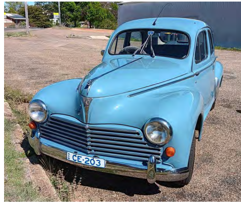
Good enough to be in the museum – Flash and Bob's Peugeot 203 (actually the number plate gives it away – it's Bob's mum's car)