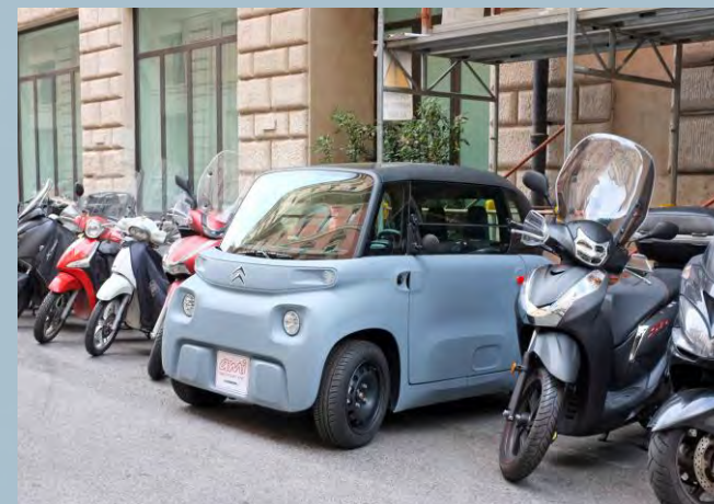
On the cover A Citroen Ami, looking right at home in a line-up of bikes, Rome 2022.