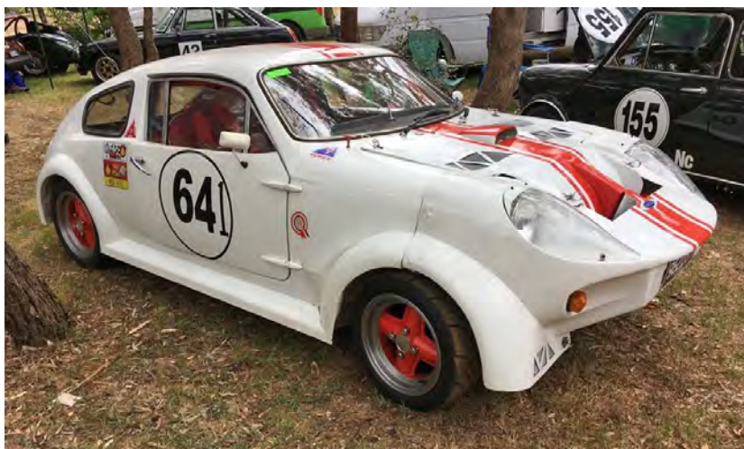
A mini Marcos - never seen one before.

[It was a kit car with a fibreglass body on a Mini chassis and running gear] See: https://en.wikipedia.org/wiki/Mini_Marcos