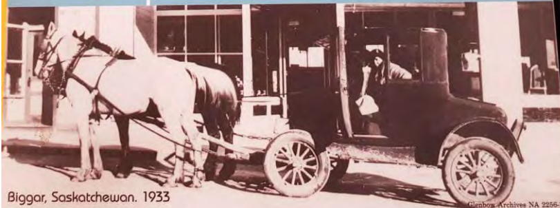
Biggar, Saskatchewan. 1933

During the Depression, many self-reliant Canadians hitched horses to their otherwise useless cars—parts or fuel had become unaffordable. Known as "Bennett-Buggies" after Prime Minister R.B. Bennett, these hybrid vehicles remain a symbol of perseverance in a time of extreme hardship.