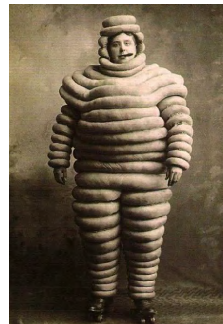
Bibendum in 1894 (above) and a more modern version on the right

https://www.facebook.com/photo?fbid=10225713105427424&set=gm.1747339152415545&id=186075975208545