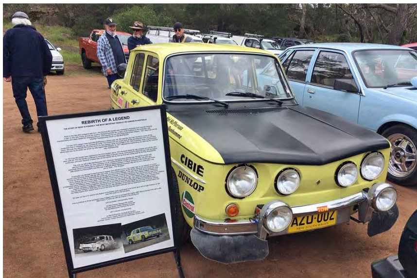
Dave Cavanaugh's R8 Gordini rally car on display