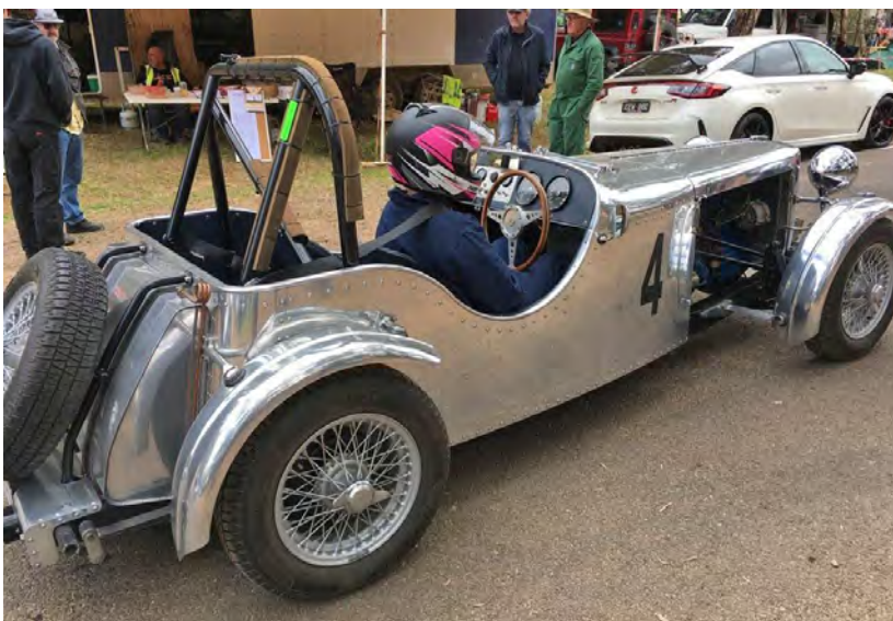
The immaculate aluminium body work on an MG.