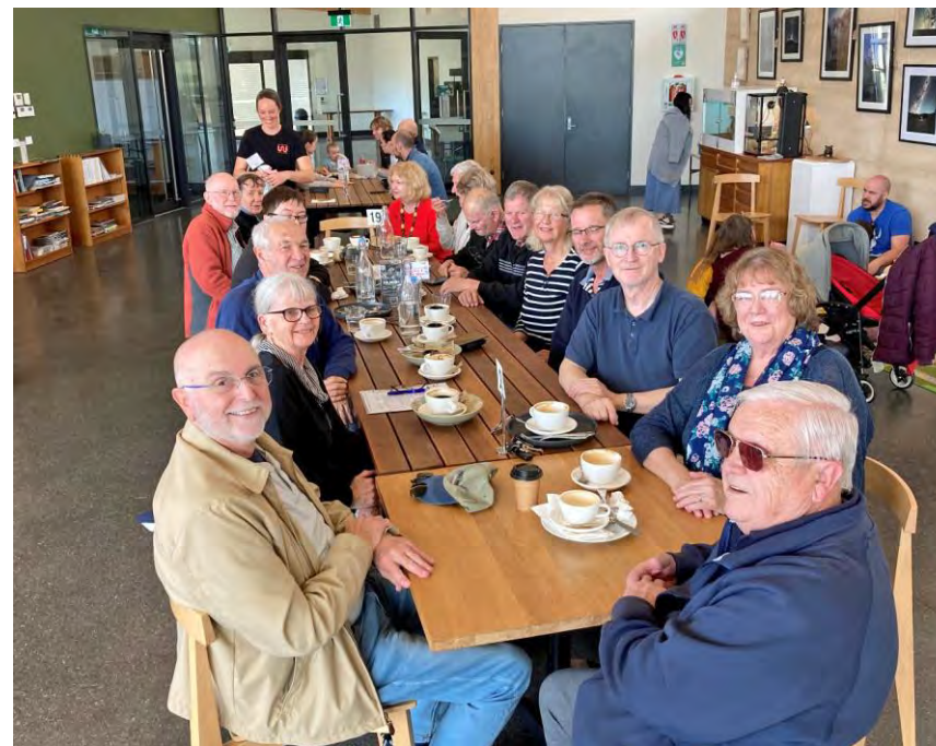
Coffee shop crew in good spirits