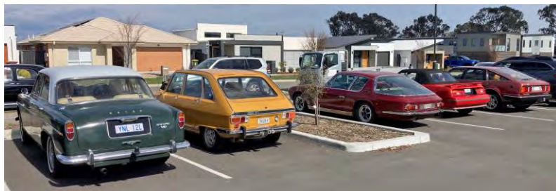
Pretty rear ends