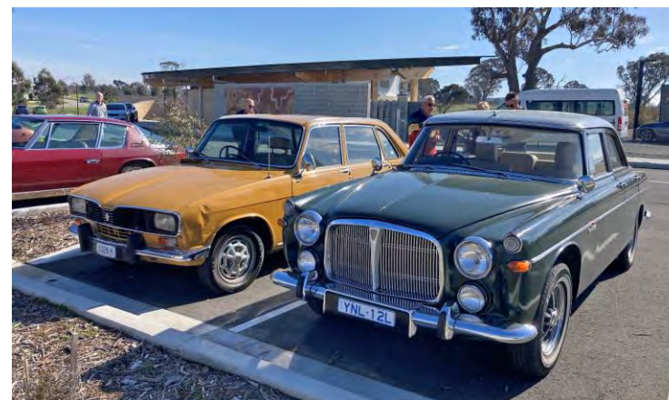
Renault 16 with a Rover P5B