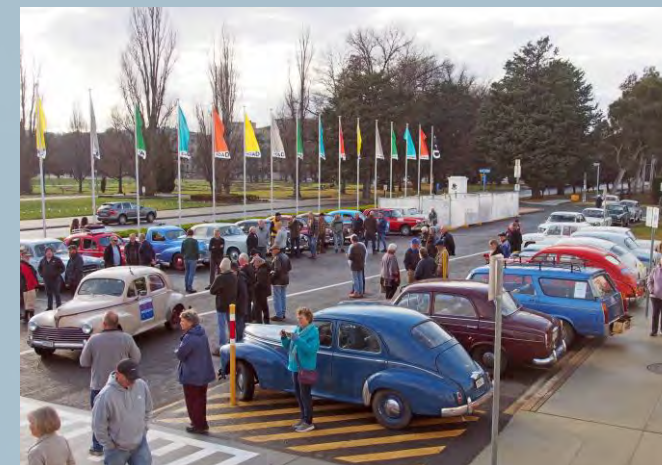
On the cover REDEX Rerun cars in front of Old Parliament House, Canberra, on 5 th August 2023