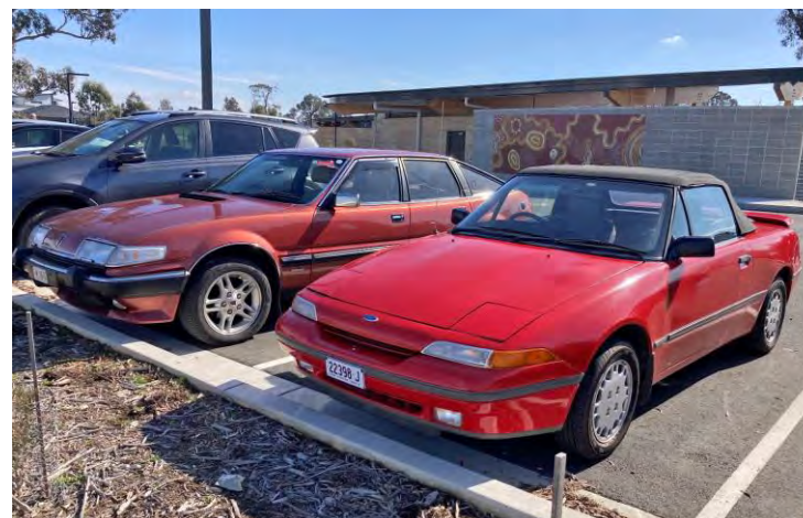
Ford Capri with Rover SD1