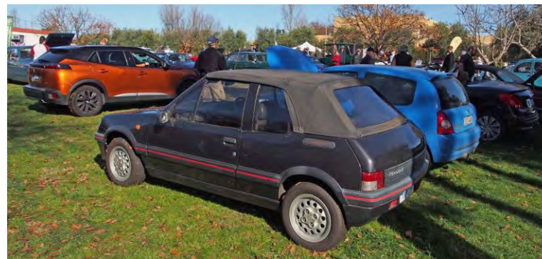
Peter Rees' unusual 205 CTi.