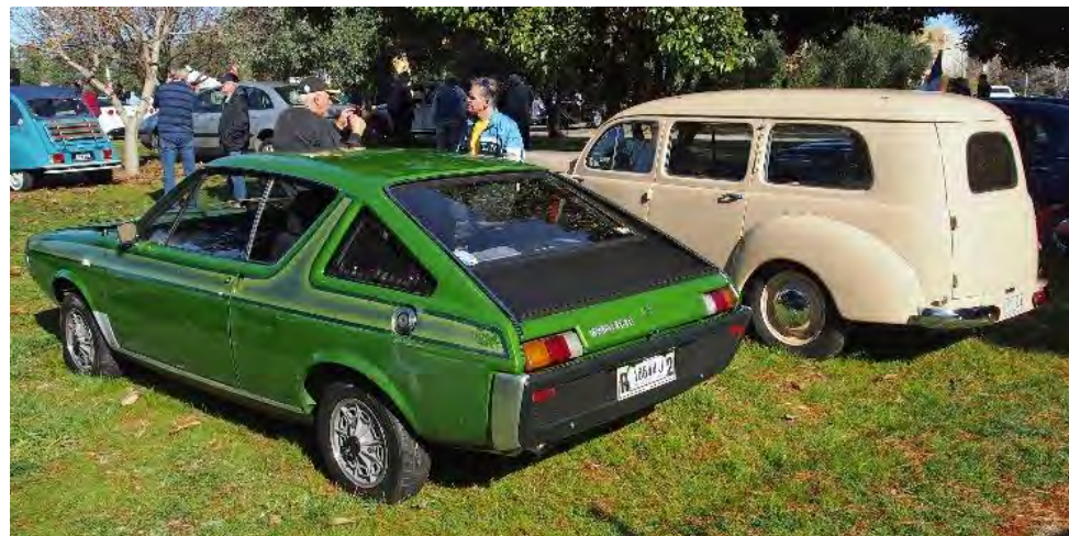
Ready for battle: a Renault 17 and a Peugeot 203 wagon in the French lines