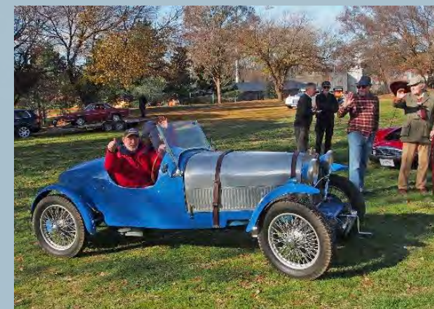
On the cover A lovely 1926 Bugatti Type 40 at the Battle of Waterloo on Sunday 19 June 2022.