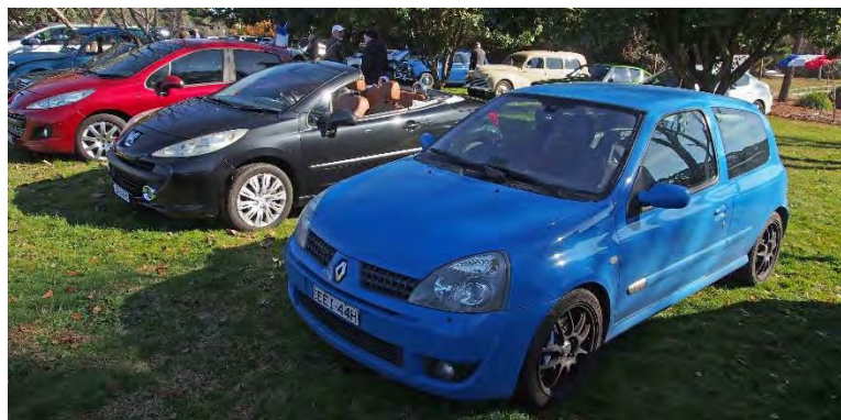
Right to left: Renault Clio Sport, Peugeot 207CC, Peugeot 207