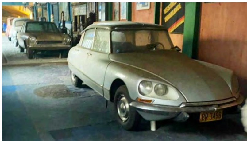
A dust-covered Citroën DS heads the line of collectible cars

The vehicles in the building spanned the period from the 1920s to the 1970s, including a Ford Model T and Citroën DS. The first floor alone included a Chevrolet Corvair, 1952 Chevrolet Styleline, Fiat 124 Sport Coupé, Simca 8, Renault Dauphine, Morris Oxford, and Hudson Hornet. All of them were complete, and the license plates indicated they hadn't been on the road in decades.