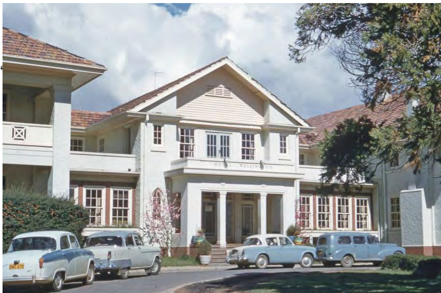
The Wellington Hotel, circa 1958.