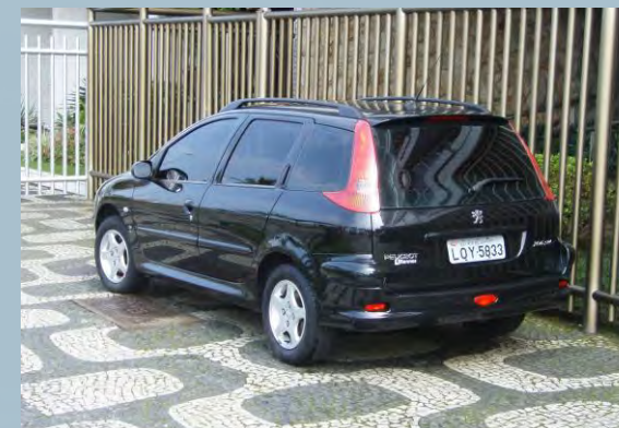
On the cover A Peugeot 206 wagon spied in Rio de Janeiro, Brazil, 2008