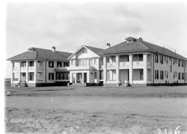
The Wellington Hotel, soon after it was completed